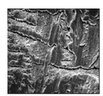
After Leading Synthetic*